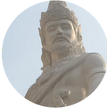
Sang Nila Utama