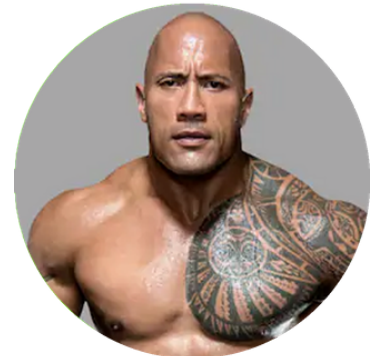
Dwayne 'the rock' Johnson