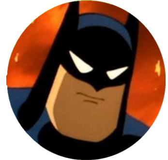
Batman / Bruce Wayne