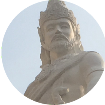
Sang Nila Utama