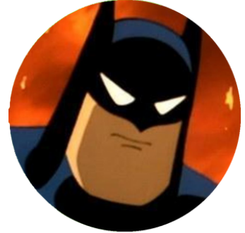
Batman / Bruce Wayne