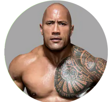
Dwayne 'the rock' Johnson