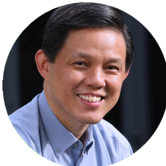
Chan Chun Sing